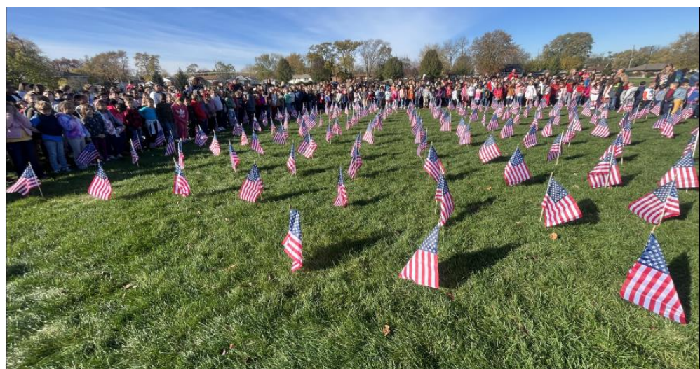
Below: The field of flags with the school children surrounding them.