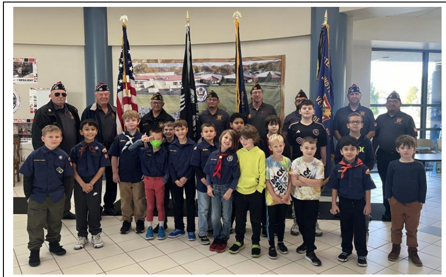
Left: Post Members posing with the Cub Scouts.

There were two functions the Post participated in during the Veteran's Day week. Our first program was to post the colors at Eads Elementary School. That was the first time we had participated in their program (at least as long as I've been involved with the VFW.) The school children welcomed us out to their "Field of Flags" that we posted by the children for family members who have served. The pledge was recited, a speech was made and the school sang a nice song to the group. Afterwards we briefly met with each grade level and answered some questions, ranging from....."What was a normal work day on the ship?" to "What year were you born?" At the end, the principal donated a check for $50 to our Post. Please see pictures below.