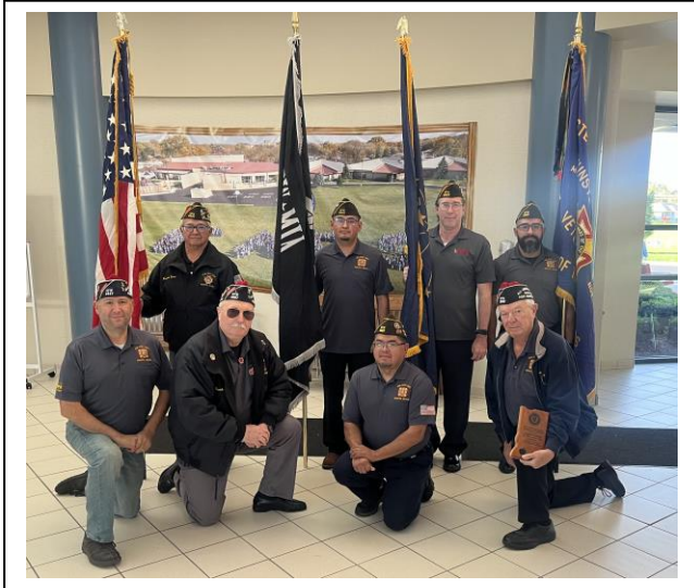
Above left: A fine-looking group of veterans. Above right: Posting the colors at the Field of Flags.